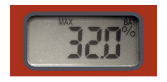
Auto Shut-Down to Preserve Battery Life

When the battery is low, BAT appears in the upper right-hand corner of the display. If ignored for too long, the meter will flash a larger BAT three times and then automatically shut down. The 9-volt battery must be replaced immediately. This shut-down action is to prevent inaccurate readings.