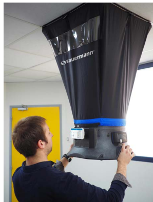
Use of the air flow meter