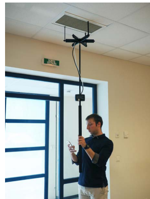
Use with the measurement grid