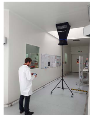
Use with the telescopic tripod