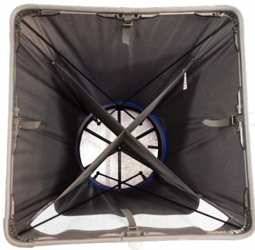
Hood with flow straightener