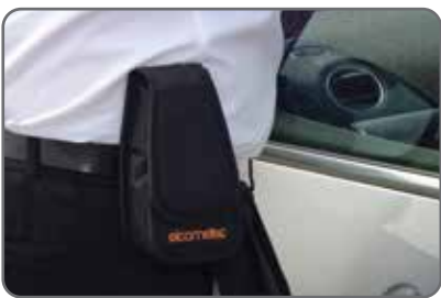
Durable & impact resistant case clips straight on to your belt

In addition to the coating thickness, the Elcometer 311 displays the key statistics such as the number of readings (n), average coating thickness ( \bar{x} ), the lowest paint thickness (Lo) and the Elcometer Index Value (EIV) 2 .