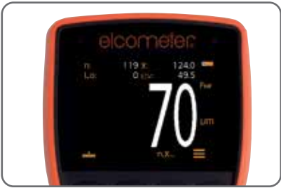
Large easy to read display