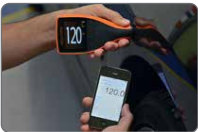
USB and Bluetooth® data output to iPhone 5 or Android™ devices

Robust, durable & weather resistant, the Elcometer 311 is available with a 2 year 3 manufacturer's warranty.