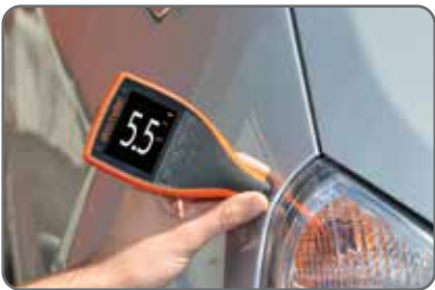
360° auto rotating display for measuring at any angle

The EIV provides the inspector with a single number which illustrates the vehicle's overall paint condition and establishes any previous paintwork (PPW) that may have been undertaken.