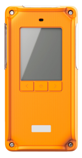
*Design can be changed