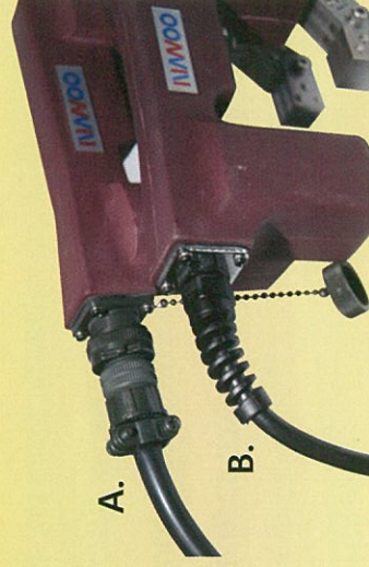
A. Cable Connector Type B. Integrated Cable Type