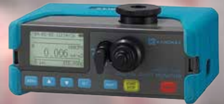
Model 3443 with rubber protector